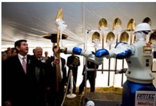
A robot hands Gov. Bob Riley a shovel for the groundbreaking of the new Robotics Technology Park.